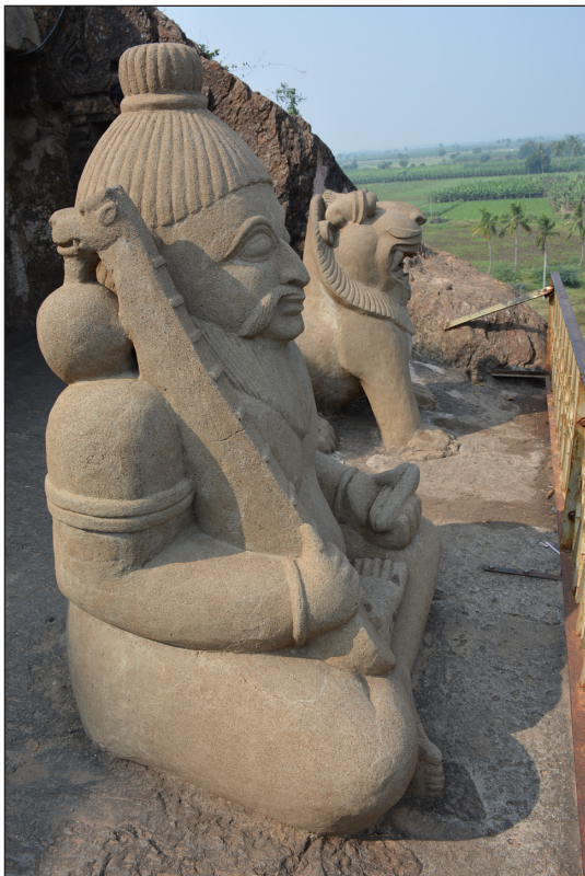
Figure 4: Narada in seated posture, depicted in Undavalli Cave of Andhra Pradesh.