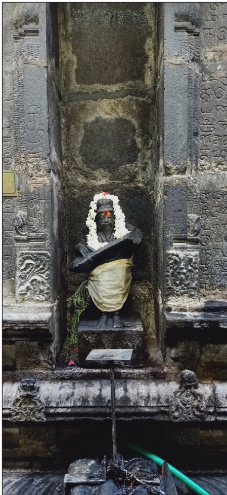
Figure 10: Sculpture of Narada, Arulmigu Dandayudhapani Swami Temple, Palani, Dindigul district, Tamil Nadu.

presented the gnana-palam , the fruit of knowledge to Shiva and Parvati and Shiva decided to award the fruit among his sons who encircle the world thrice. Ganesha wittily won the fruit by circumnating his parents. Kartikeya (Murugan) was furious and settled in Palani as a hermit. As per the legend, saint Boghar was responsible for the establishment of a shrine dedicated to Murugan at this place. In the present temple architecture, influence of both Chera and Pandya dynasties can be observed. The Narada image is placed on the southern wall of the temple. He is shown in samapada (upright) posture playing veena with his right hand. The left hand of the sculpture is damaged, however, based on other instances, we can assume the damaged hand to be shown in vitarka mudra .