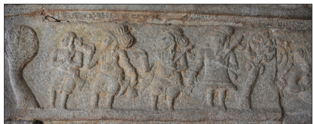
Figure 16: Narrative panel, Lepakshi temple, Andhra Pradesh.