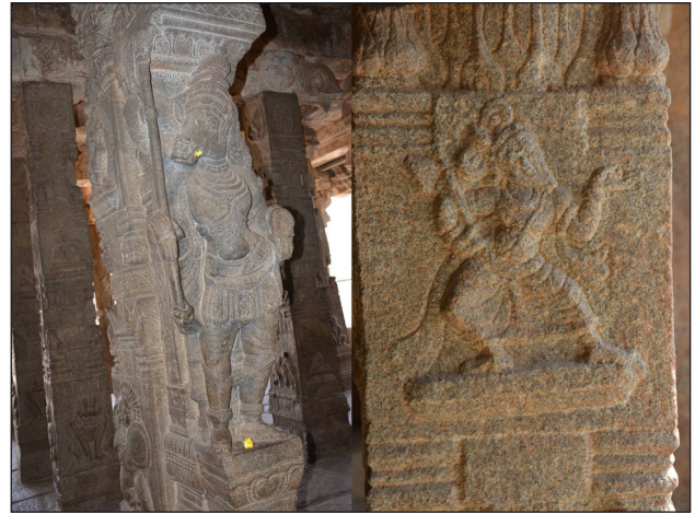
Figure 8: Depictions of Tumburu on the pillars of Veerabhadra temple of Lepakshi at Andhra Pradesh.

located in the Anantapur district of Andhra Pradesh. A life sized Narada ( Figure 6 ) in upright posture can be observed on one of the pillars of Kalyana mandapa . In the