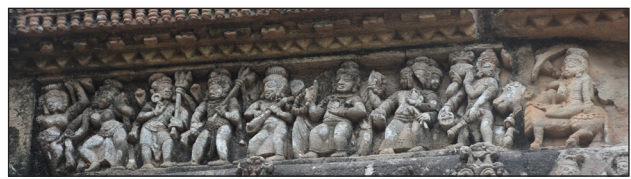
Figure 15: Narrative panel, Satruganeswar temple, Bhubaneswar.

Another panel with Narada depiction can be seen on wall of Veerabhadra temple of Lepakshi ( Figure 16 ) in Andhra Pradesh. This seems to be a depiction from Parasurama's story. There are four figures in this panel. A female, a sage with kamandala (sacred oblong water pot) and danda (armrest used by sages), Narada and an ascetic figure holding a parasu (axe) are shown here. Here Narada is shown holding a tambura in his left hand. The right hand movement indicates that he is in conversation.