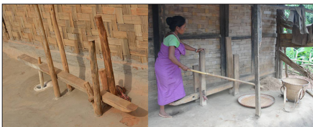
Figure 17: Dheki used in rural Assam.

The Dutta Para Temple in Joypur of Bankura in West Bengal is a forty feet tall temple standing on a square base plan. On the eastern wall of this temple we see two narrative plaques depicting Narada. From the left, first shows the depiction of Kamale Kamini , a scene from medieval Bengali literature Chandi Mangal . Here depiction of the Bhagavata story where sick Krishna is asking his wives for dust of their feet as medicine. The wives were scared as it would be a sinful act and thus did not oblige. In this