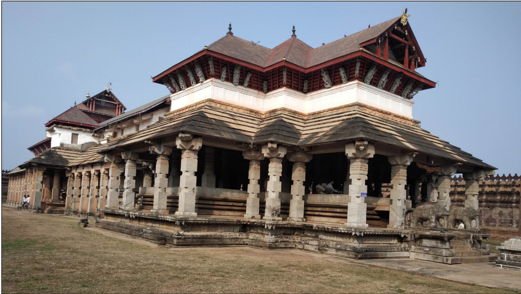
Figure 11: Tribhuvana Tilaka Cudamani (Thousand Pillars Temple), Moodabidre, Karnataka.