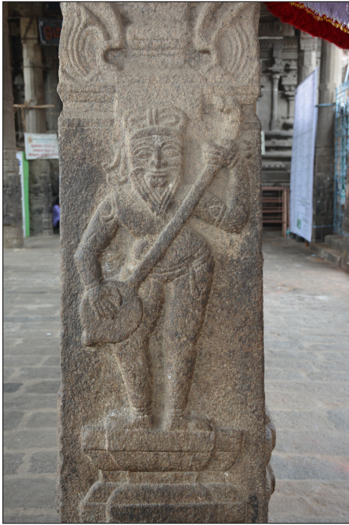
Figure 9: Sculpture of Narada, Parthasarathy Temple, Triplicane, Chennai, Tamil Nadu.