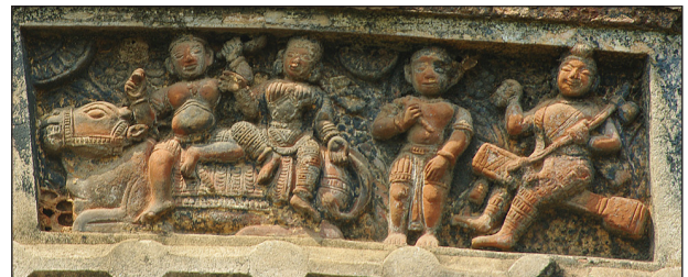
Figure 18: Narada reaching Kailash on his vehicle dheki , depicted at Dutta Para temple, Joypur, in Bankura, West Bengal.

Another temple complex at Uchkaran in West Bengal has a cluster of four Char Chala Shiva temples standing on a single platform adorned with intricate terracotta art on their walls. The temples were founded by Harendra Nath Sarkhel in 1768 (Gupta 2019). These temples are protected by the State Department of Archaeology, Govt. of West Bengal. One of the façades has a depiction of sage Narada with veena in hand sitting on a dheki . In the same plaque, a dwarf Gandharva (nymph) is also shown playing a flute (Figure 19).