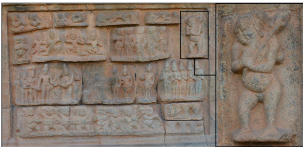
Figure 14: Images of Kalyanasundara and Narada, Brihadishwara temple, Tanjavoor, Tamil Nadu.

A Kalyanasundara image having Narada depiction is observed from Brihadeshwara temple ( Figure 14 ) at Tanjavoor in Tamil Nadu. The complete Panigrahana is depicted on the outer wall of the gopura . We can witness Shiva holding Parvati's hand surrounded by different deities around him. On the left most part of the wall we can see depiction of Narada. Amusingly here Narada is depicted with just a kaupina (loin cloth). He is shown with elongated ears, beard and moustache. The veena Mathali is resting on his right arm and his hands are in anjali mudra or namaskara mudra . This particular mudra is a hand postures where two palms are facing and joining each other and raising to the level of the chest indicating reverence or devotion or salute. One more Kalyanasundara sculptural