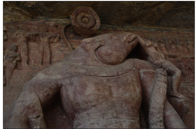
Figure 13: Narada and Tumburu in the famous Varaha sculpture in the Udaygiri Cave no. 5 in Madhya Pradesh.

The earliest sculptural representation of Narada can be seen in 5 th century CE Gupta caves at Udayagiri near Vidisha in Madhya Pradesh. The famous colossal rock-cut depiction of Varaha incarnation ( Figure 13 ) of Vishnu depicted in Cave No. 5 of Udayagiri contains distinctive images of Narada and Tumburu along with many other divine beings. The musical skill of Tumburu and Narada is