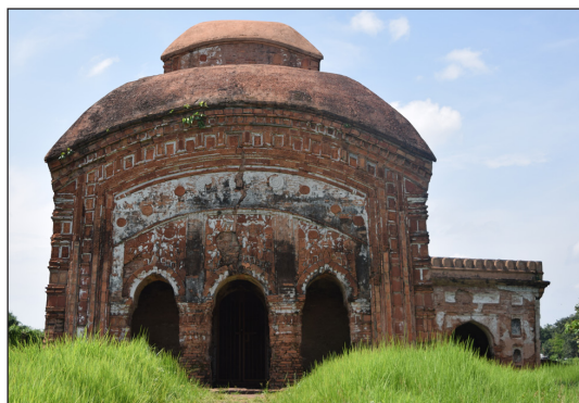
Figure 20: Ghanashyam's House at Joysagar, Assam.

The plaque containing image of Narada at Ghanashyam's House is 22 cm in height and 15 cm in width (Figure 21). This terracotta plaque is placed on the entrance wall (southern wall) of the house. The Narada depiction here