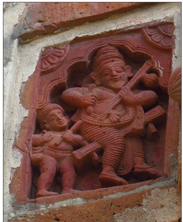
Figure 19: Narada on dheki , represented at Uchkaran in West Bengal.