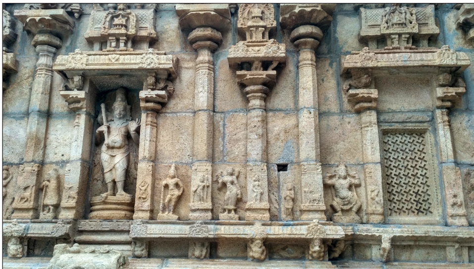
Figure 2: Depiction of Narada on the temple wall at Srirangam, Tamil Nadu.

Two rock-cut images of Narada can be seen in Undavalli cave ( Figure 3 ) in Guntur district of Andhra Pradesh. Undavalli is located 6 km southwest from Vijayawada and 22 km northeast of Guntur city. This rock-cut cave temple complex is said to have been created during the Vishnukundi dynasty (CE 420–620). This cave temple complex is centrally protected by Archaeological Survey of India. The Narada sculptures are found in the façade of the east facing four storied monolithic rock-cut cave. Both the images can be observed on the third floor of the temple. A life sized Narada ( Figure 4 ) in seated posture can be seen on the façade of the third floor. Here Narada is sculpted with other alvars . The alvars , also spelt as alvars means 'those immersed in god' were Tamil poet-saints of South India and devotees of Lord Vishnu. There may be differences of chronology of these images with the rock-cut temple structure. Sage Narada is sculpted on the left most corner of the façade. Here Narada is shown sitting in padmasana , veena is placed on his left thigh and it is supported by his left hand. In his right hand he is holding the kartal. Jata (dreadlocks), moustache and beard are beautifully depicted. Armlets and