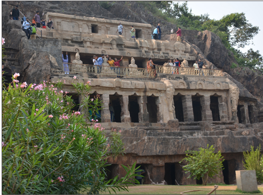
Figure 3: Rock-cut caves of Undavalli, Guntur district of Andhra Pradesh.