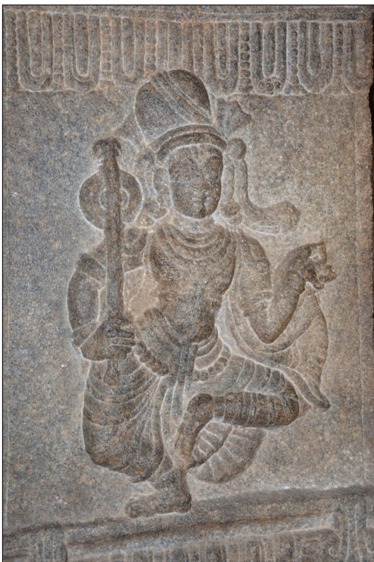
Figure 7: Narada in dancing posture, Lepakshi of Andhra Pradesh.

located in the Anantapur district of Andhra Pradesh. A life sized Narada ( Figure 6 ) in upright posture can be observed on one of the pillars of Kalyana mandapa . In the