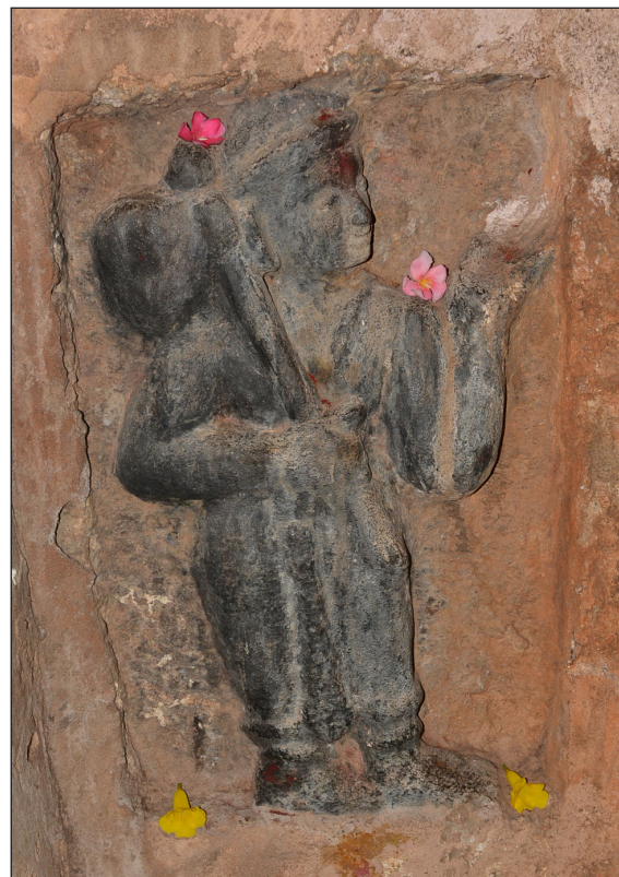
Figure 5: Sculpture of Narada from Undavalli Cave of Andhra Pradesh.

bracelets can be seen on both the arms. Lower and upper draperies are without any decorations. The second image ( Figure 5 ) is found inside the same floor and it is in standing posture. Here Narada is facing north, holding tambura in his right hand and kartal in the left. Flattish kind of headgear can be observed and lower and upper drapery covers the whole body of the image.