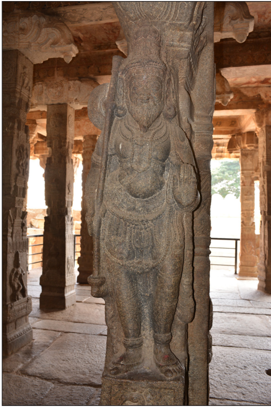
Figure 6: Sculpture of Narada, Lepakshi of Andhra Pradesh.